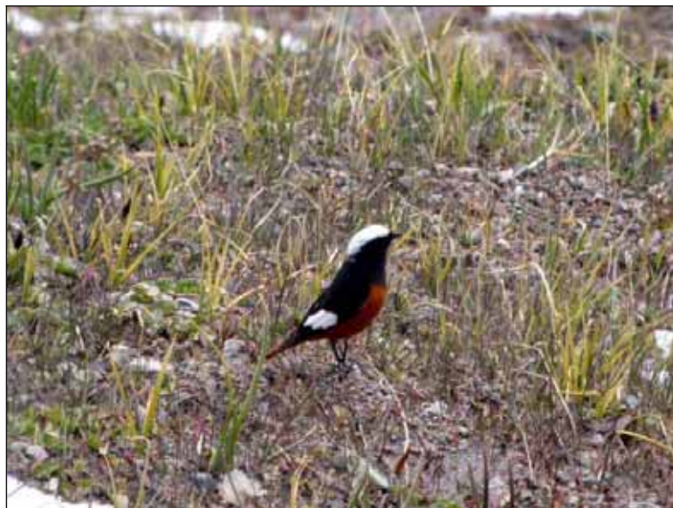
Guldenstadt's Redstart

We started our day at 7 with a good breakfast with caviar! We went to Yeti Oguz only 20 km away from Karakol. Yeti Oguz is famous for its red sandstone mountains. When entering the park we immediately started with a fine male Guldenstadt's Redstart. In a time range of 20 minutes we had 6 individuals of Guldenstadt's!! They come down from the high mountains because of the snow and are now easily to see. In spring you have to make a lot more effort to see them. Our morning started perfect, only a half hour later we had a flat tire but with the help of some locals we did not lose much time. Driving further we saw the immense and beautiful red sandstone mountains, Madina D. discovered a Wallcreeper and a few minutes later I had a second one. The park has lots of Pine forest and we checked at the tops for Northern Hawk Owl but unfortunately we could not discover one. We did see Coal Tits, Buzzards spec. and Dipper. When leaving the forest area we saw a male Evermann's Redstart on 4 meters distance, all where in a state of ecstasy. Next we made a small stop near the river and of course we saw multiple Azure Tits. It seems if you have water and some high scrubs Azure Tit will be there. Next to these splendid Tits we also had Red-fronted Serin, Bearded Vulture and more Guldenstadt's as most beautiful birds.