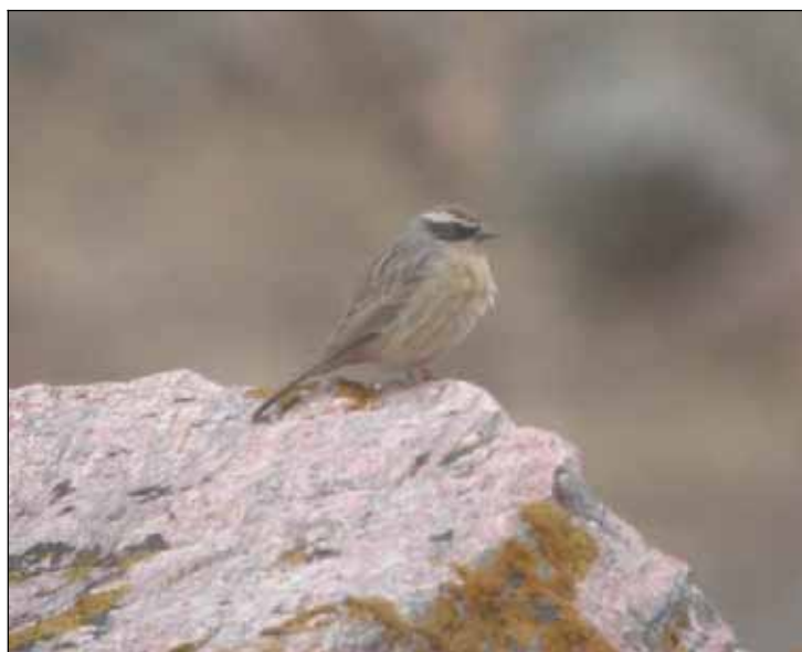
Brown Accentor

After 5 km we had a first small stop for a group of 80 Grey-faced Goldfinches, who were just magnificent, they all had a fresh plumage. After some more small stops for pictures of the scenery we made a stop for 15 minutes and did some walking. We saw our first Black-throated Accentor, Bearded Vulture, Golden Eagle and again Azure Tits. Here in the Cholpan Ata Gorge we saw more Azure Tits then Great Tits!