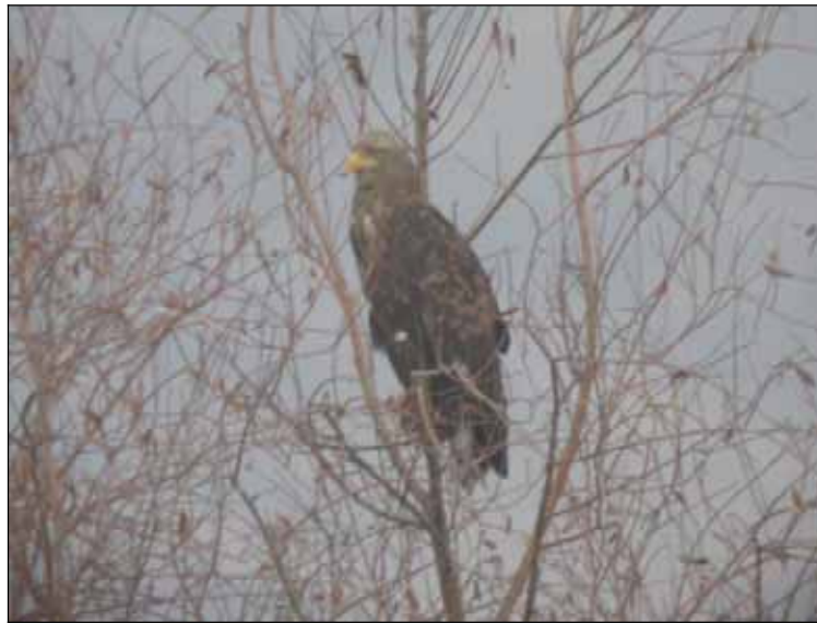
White-tailed Eagle

Our next aim was the Tokmok Forest. We would go there by following the Chuy River, the natural border with Kazakhstan. At 12 o'clock we stopped for lunch near the Chuy River and recorded immediately our first Pygmy Cormorant. Next to this we also saw Little Grebe, Great Egret, Red-breasted Merganser, Buzzard spec. and our first White-tailed Eagle. After the lunch which where noodles we headed further east to Tokmok. Along the way we wrote down the most interesting birds; White-tailed Eagle 4, Buzzard spec. 9, Long-legged Buzzard 3, Marsh Harrier 2, Great Egret 4 and Little Grebe with 34 individuals is also worth noticing. Arriving at Tokmok Forest it seemed that forest should not be taken to literally as there where trees but the biggest area was covered by Reed ( Phragmites spec. ). We eventually have some great sightings of Great Grey Shrike of the homeryi sub-specie and a large amount of teals, Pygmy Cormorants, Mistle Trushes and a single Hen Harrier.