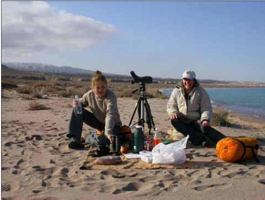
Lunch at Issyk Kul lake