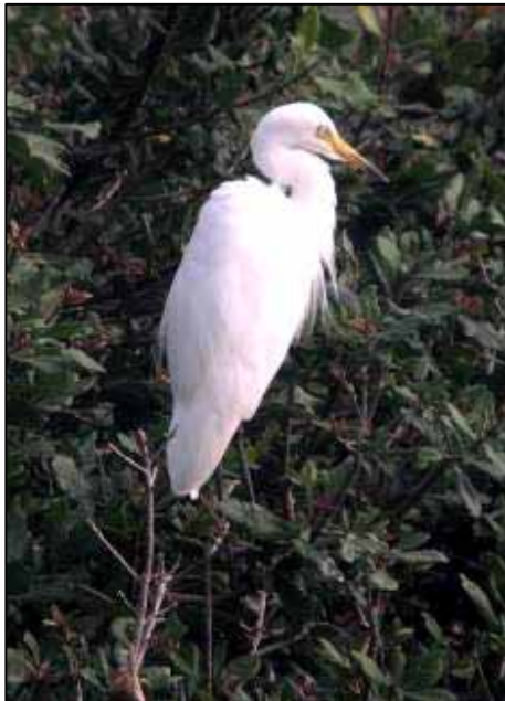
Intermediate Egret Mesophoyx intermedia

The Sanctuary itself was filled with water. After paying the entrance fee (5Rs, 10 for parking, 25 for the camera) I went up to the dam. The sound background was fantastic. Thousands of birds were breeding in the heronry: Painted Storks, Openbills, Spot-billed Pelicans, Spoonbills, Grey Herons, Black-crowned Night-Herons, Intermediate Egrets, Little Egrets, Cattle Egrets and Little Cormorants. In a big bamboo some Flying Foxes were sleeping.