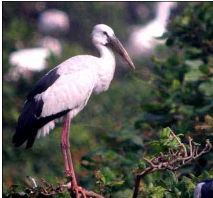
Asian Openbill Anastomus oscitans