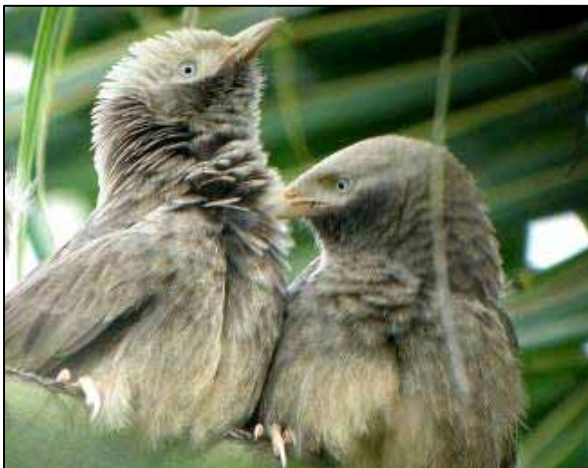
Yellow-billed Babblers Turdoides affinis

Lake Ousteri is an old artificial lake west of Pondicherry. I spent the morning at the Lake Garden of the Sri Aurobindo Ashram. I did some digiscoping and a Grey-bellied Cuckoo, a Black-headed Cuckooshrike and a lonely Spot-billed Pelican were nice additions to the list.