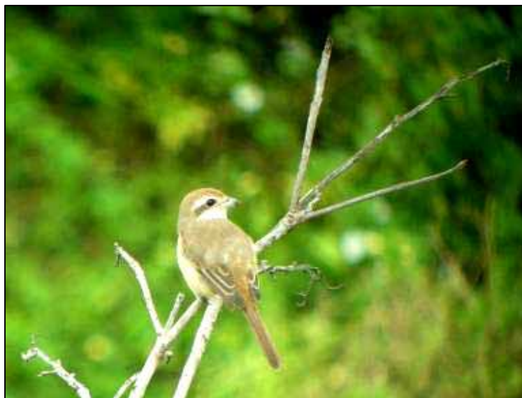
Brown Shrike Lanius cristatus