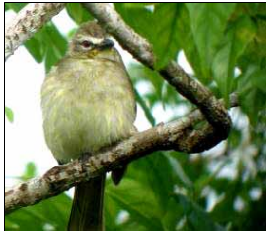
White-browed Bulbul Pycnonotus luteolus