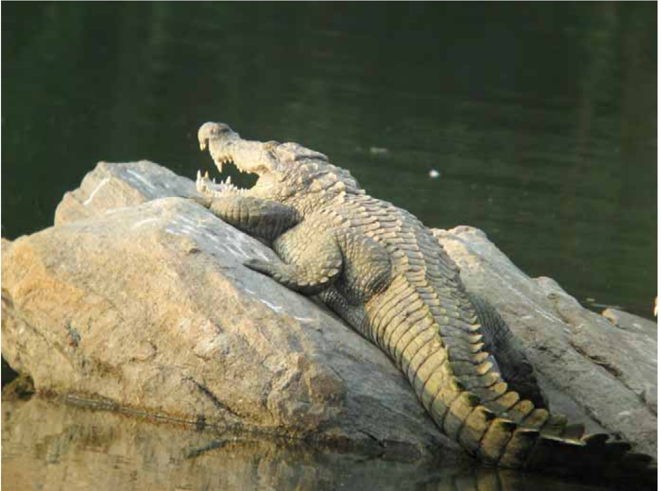
Mugger at Ranganathittu.

Jan. 31 Flight from Bangalore 3 a.m., back in Sweden early p.m..