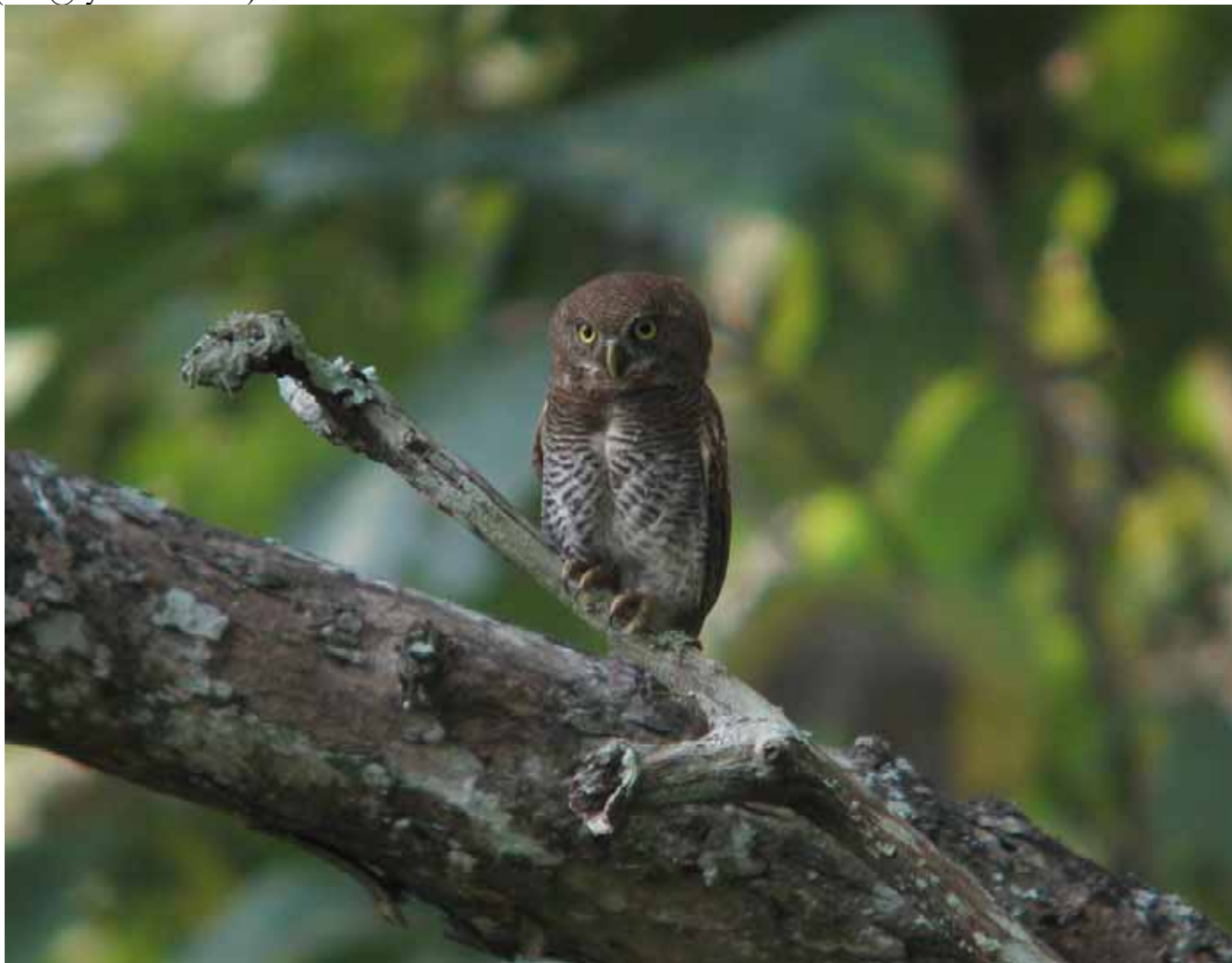
Jungle Owlet, Glaucidium radiatum malabaricum, at Top Slip.