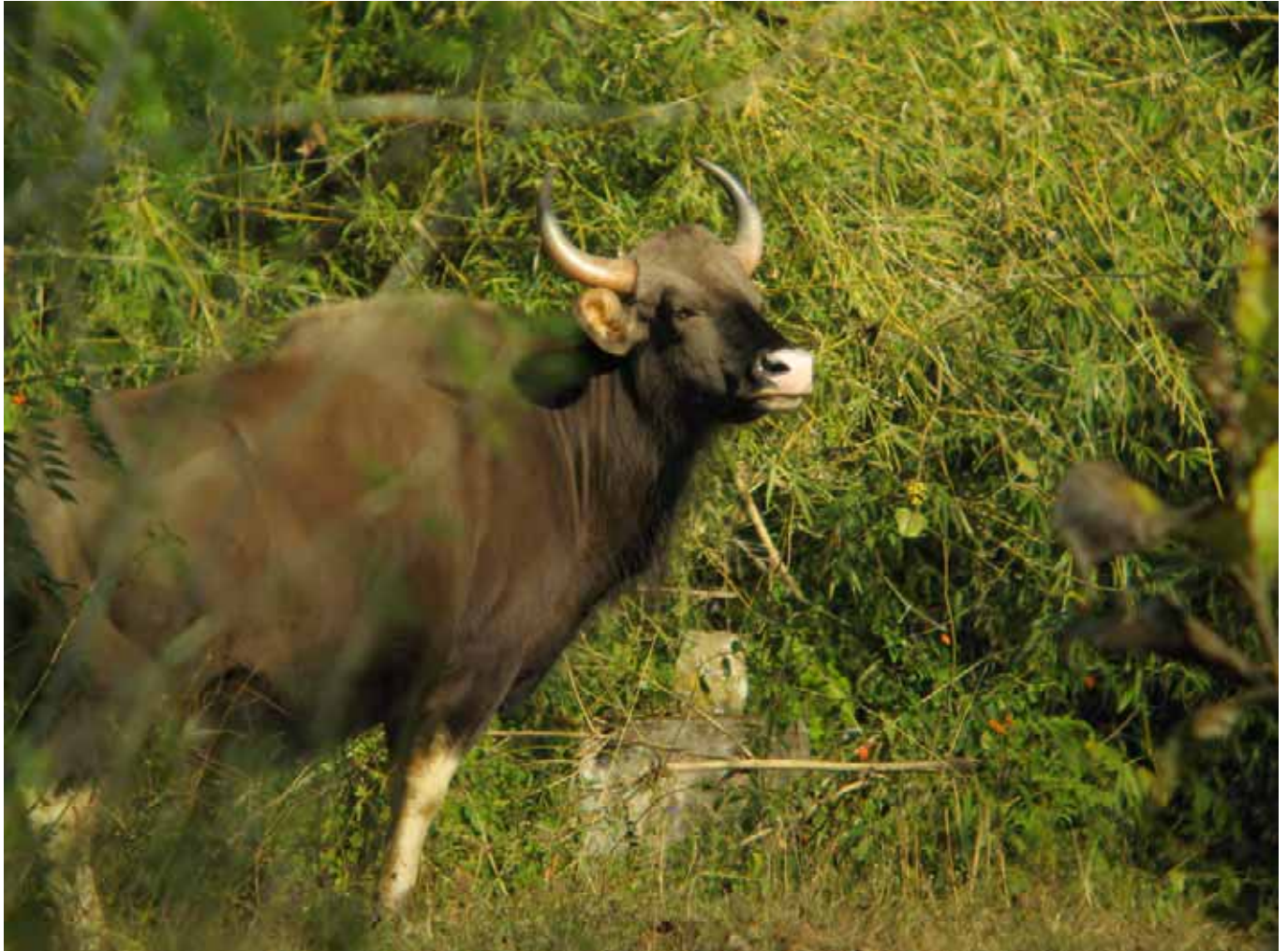
Gaur at Masinagudi / The Wild

Common Rosefinch Carpodacus erythrinus 1 pair along the road to Ooty near Masinagudi 28.1.