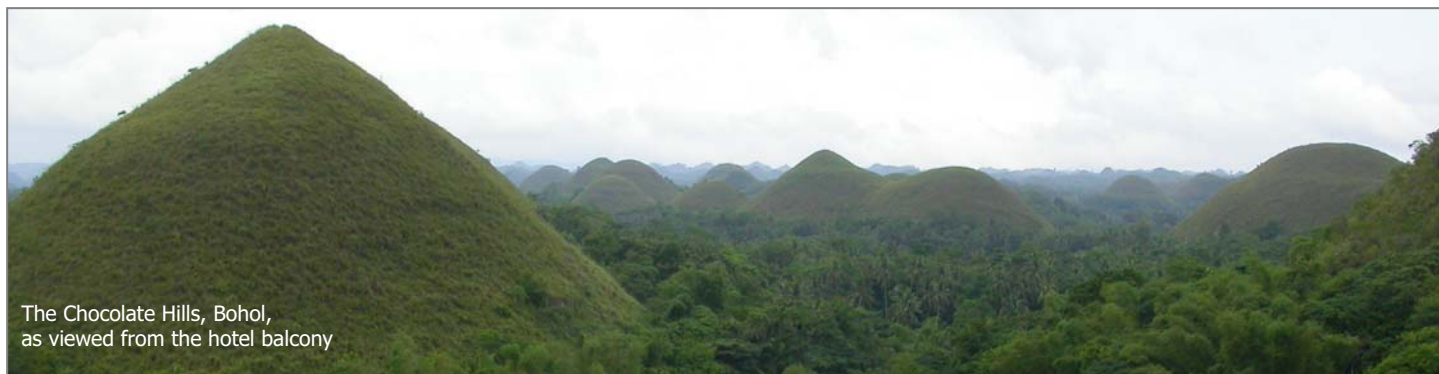
The Chocolate Hills, Bohol, as viewed from the hotel balcony

Note that one of the most productive trails, perhaps because it remains damp and shady, was the first you come to on the left if you face the main forest at the ranger station and walk the road to the right. The bleeding-heart moment and fantastic, walk-away views of Red-bellied Pitta were both from this trail.