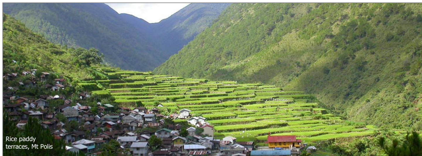
Rice paddy terraces, Mt Polis

Good species seen during our very worthwhile morning on Polis included: Luzon Water Redstart, Chestnut-faced Babbler, Green-backed Whistler, Mountain Shrike, Long-tailed Ground-warbler, Luzon Bush-warbler and Island Thrush .