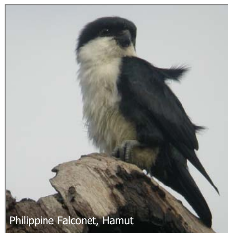
Philippine Falconet, Hamut

We targeted 14 of the 15 traditional Taiwanese endemics, opting to forego Styan's Bulbul . Other important birds were Fairy Pitta and Malayan Night Heron , and we were confident that many of the other Taiwanese forms would show along the way. After reading a few trip reports and the gen-packed BirdingASIA Number 2 (OBC 2004; trip reports listed below), we believed that 5 days or so would give us a real chance of a successful trip. We lost a day or so to rain but still saw all our targets with relative ease. This was in no small part due to some excellent information gleaned at short notice – and full details follow.