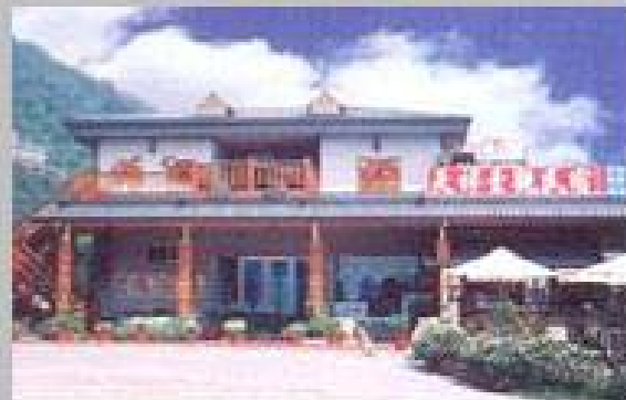
Home Stay at Wushe